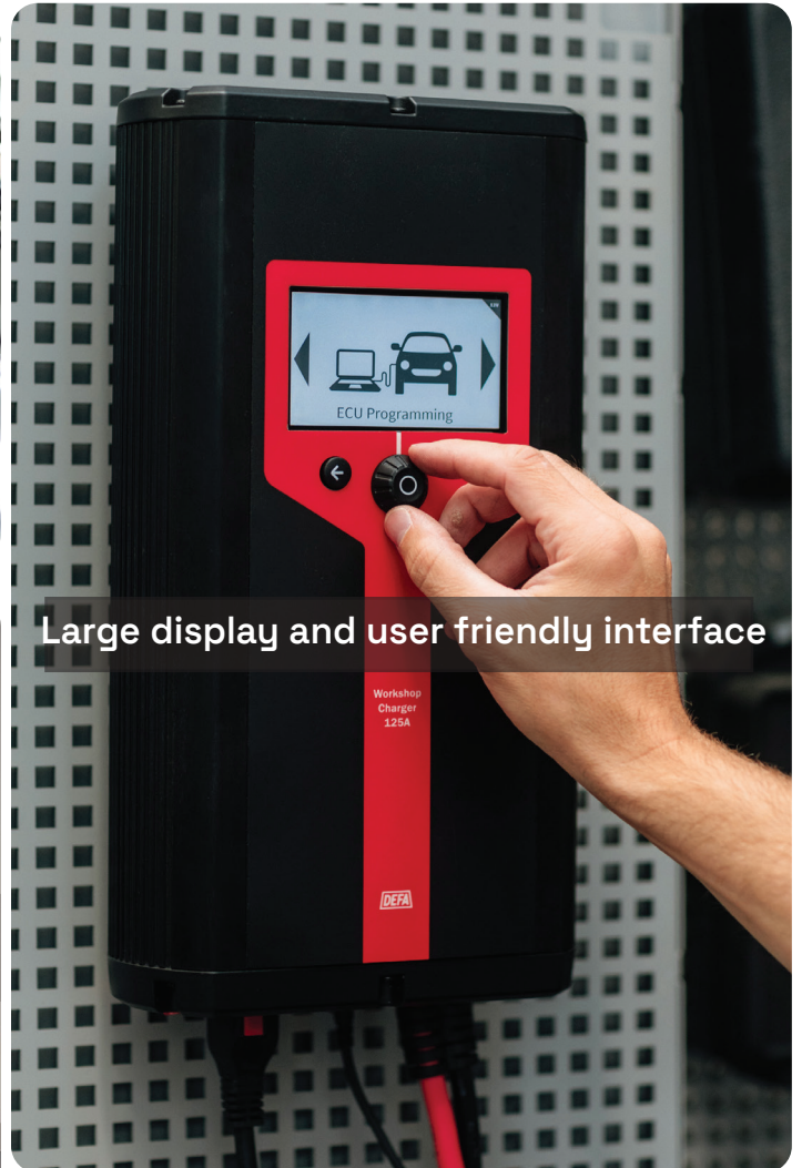
Large display and user friendly interface

WorkshopCharger 90-125A Part #: 521-RAE-710000